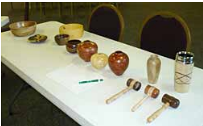
July Show and Tell