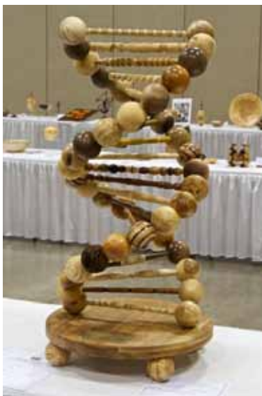
Wisconsin Valley Woodturners "Turning is in our Genes" Best of Show 2011