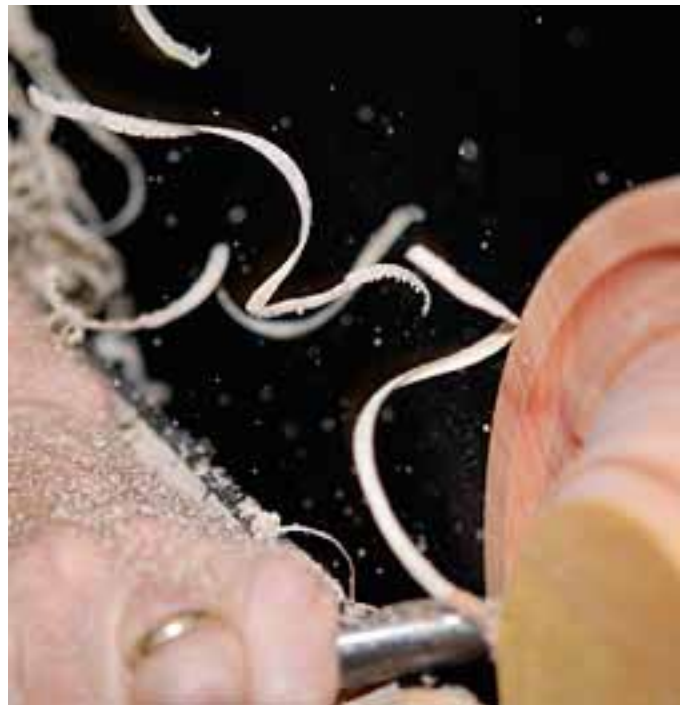
Wet wood makes for long chips.

For Sale: Apollo Model 700 HVLP Spray System. Old but works fine. Some extras. $30 Dave Peck, 485-7458