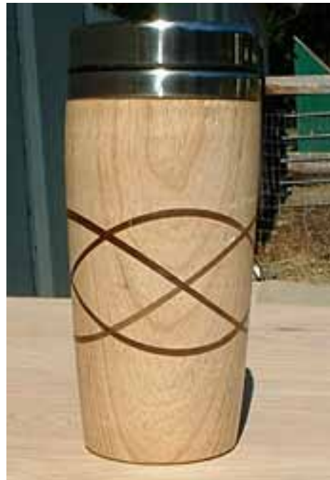
Coffee mug by Dean M.

For Sale: Apollo Model 700 HVLP Spray System. Old but works fine. Some extras. $30 Dave Peck, 485-7458