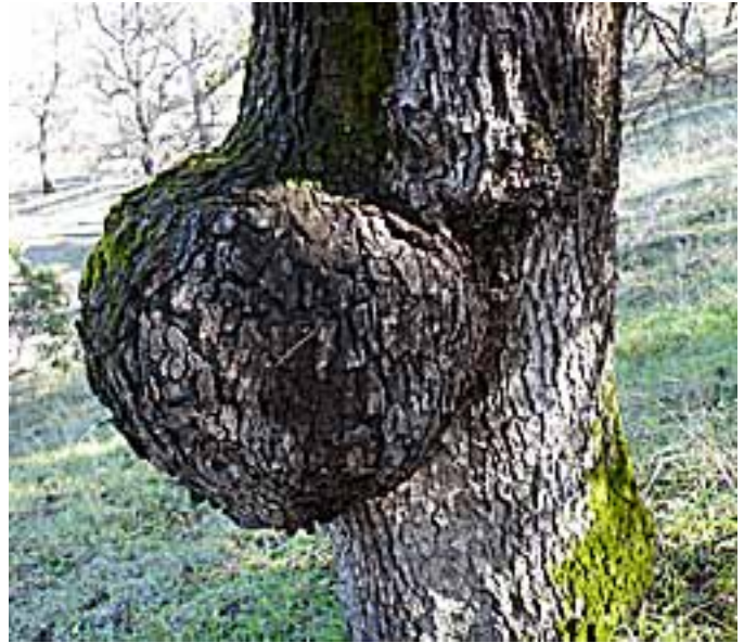
Don't you wish

Dave and Noble provided a Saturday mentoring session for 3 members. The basics of spindle turning were covered and practiced followed by the turning of a small tool handle.