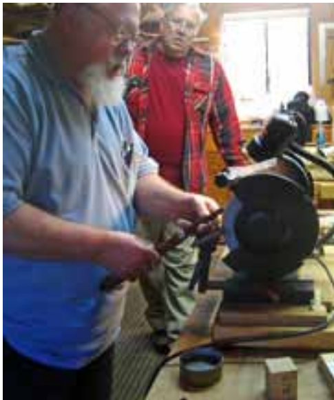
Noble and Larry grinding away at February Group Mentoring Session