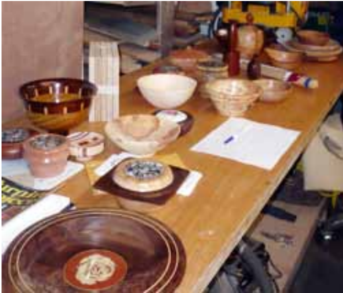
March Show and Tell